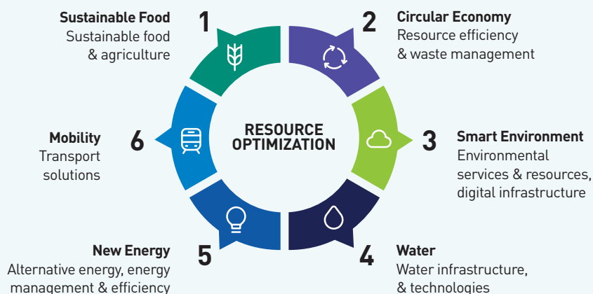
Chart illustrates the six areas of resource optimization. Actual allocations are not divided equally.