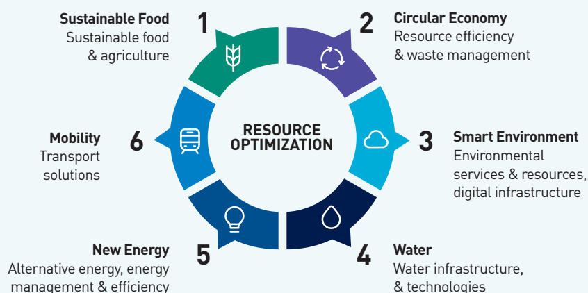
Chart illustrates the six areas of resource optimization. Actual allocations are not divided equally.